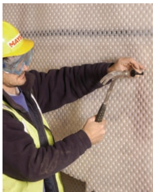
Step 3: Driving the fixing home.