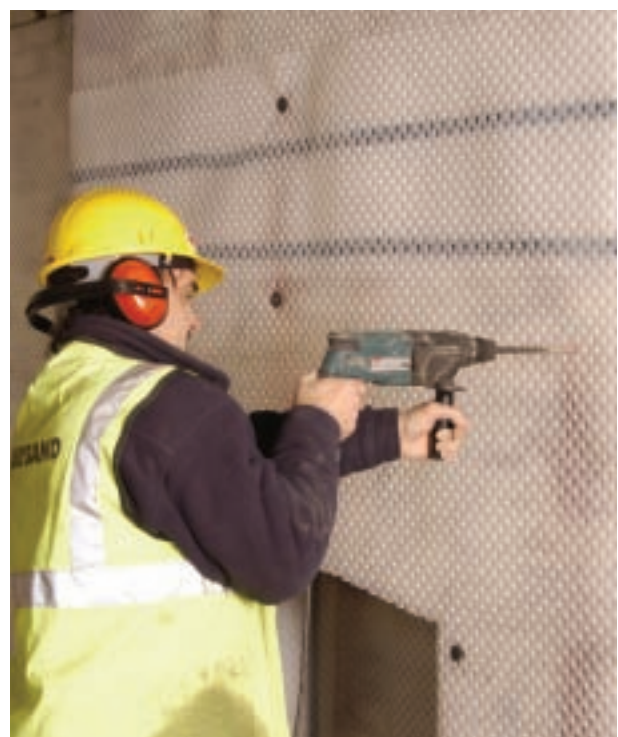
Step 1: Drilling through the membrane to accept fixing plug.

Fixing densities will depend to some extent on the choice of final plastering finish but should never be less than 600 mm centres for dry lining and 250 mm centres for plasters or dot and dab adhesives. The shank of the plug is sealed to the face of the membrane with Wykamol Rope wrapped around the shaft at least two turns before driving the fixing home with a wooden mallet. In all damp proofing and water proofing applications Wykamol CM Membranes are sealed at flanges (a band of membrane running along the edge with no studs) with Wykamol Tape. Stud-to-stud joints are overlapped by at least two rows (three in very wet conditions) and the flat area of membrane between rows sealed with Wykamol Rope (two runs of Rope in the case of three stud overlaps). Always ensure flanges run vertically on walls and they are positioned in front of the preceding width of membrane. In the case of horizontal joints the lower sheet is always positioned to the front. In severe conditions of water ingress, in addition to the above, joints may also be closed off using Wykamol Overseal tape.