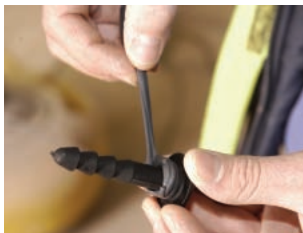
Step 2: Waterproof rope is wrapped around the plug before fixing takes place.

CM8/CM20 - stud frame: where this method of finishing is anticipated the brick plugs should be in a vertical line roughly corresponding to the stud locations and battens (min. 25 x 38 mm) fixed to the plugs using 6 mm bolts or No. 12 screws. If it is not possible to ensure a straight line for the stud fixings use e.g. 'Gyproc' brackets to hold the battens in place. When fixing plasterboard ensure the screw depth does not perforate the CM membrane. On reasonably flat walls Wykamol Dab Collars can be used to provide a key for board adhesives. The collars, which incorporate a built in fixing plug going through the centre of the collar, are sealed as before with rope on the collar face rather than under the fixing plug head. The fixing collars are set out according to the width of the plasterboard to be used at centers not less than 600 mm.